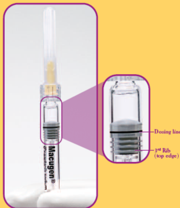
Fig 1. Before expelling air bubble and excess drug